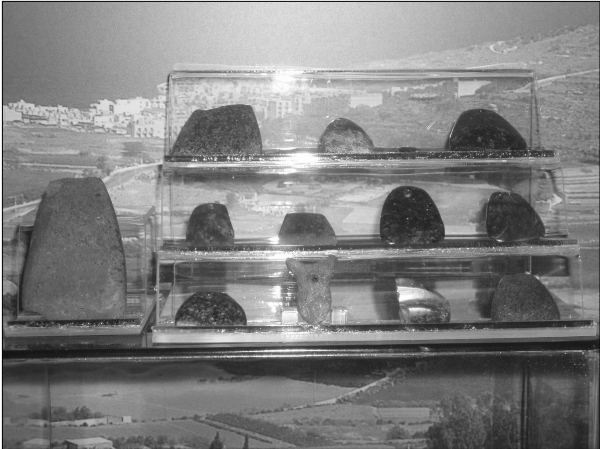
FIGURE 2: (Above) Idiophonic jewellery from Brochtorff Circle, Xaghra, Gozo (3400- 2500 BC). (Below) stone pendants.