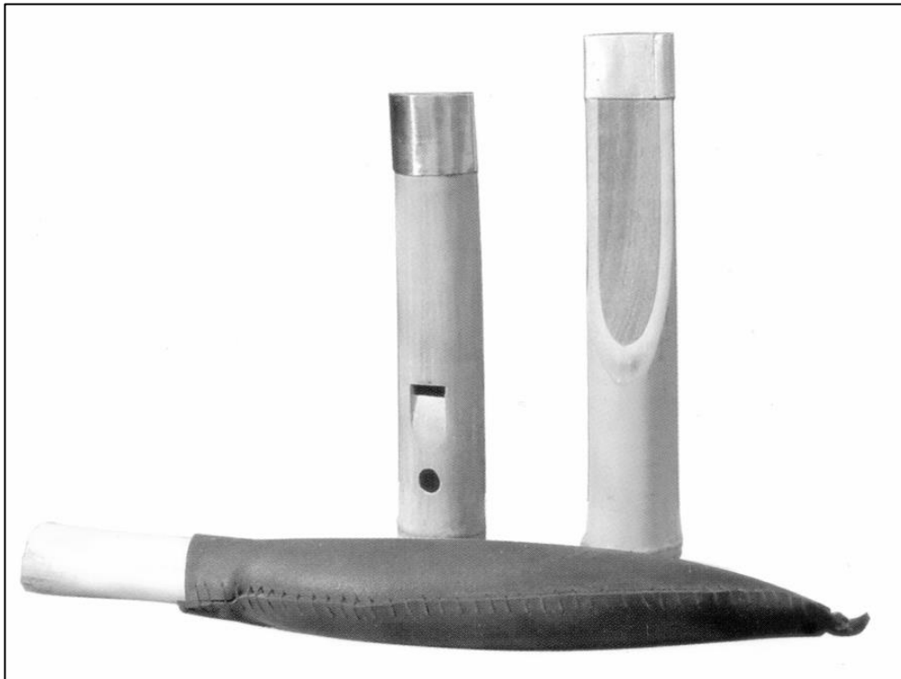
FIGURE 1: Sfafar tal-Pluvieri, a Maltese hunting whistle or bird call.

wherein auditory experiences play an important role. For example, by attributing meaning to sounds, our ancestors recognised that these could signify danger (Scarre and Lawson, 2006). In Malta, early hunter-gatherer groups may have categorised and reproduced sound phenomena through sound mimesis or devices which serve as calls for animals and birds during hunting. The practice of using sound devices to attract animals is still ongoing in Malta. Devices known as sfafar tal-pluvieri or plover whistles are used to imitate bird calls and entice them towards a trap (Zahra, 2006; Figure 1).