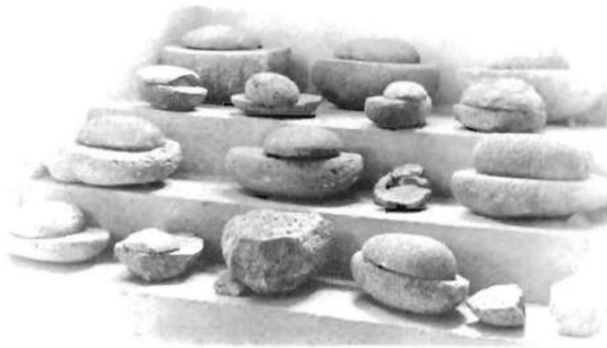
FIGURE 3: Saddle querns from Tarxien Temples (Figure reproduced from Zammit, 1930, Plate XXIII).